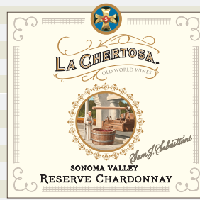
CHARMING WITH OAK AND SATIN TONES