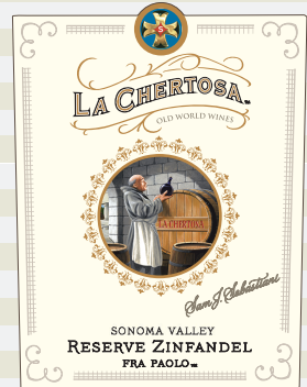
ELEGANT, GENEROUS AND DEEP-HUED